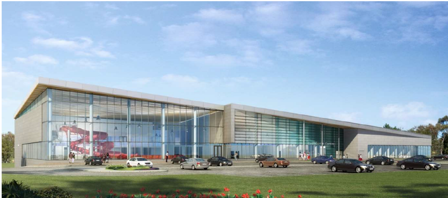
Entrance view from carpark